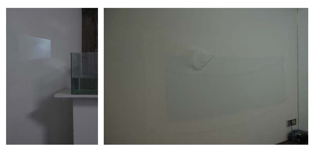
Figure 12-14: Pretend not to see , 2013, string, fabric, paper, wall, floor, window, mirror, water, tank, projector, clay, etc. / dimension variable