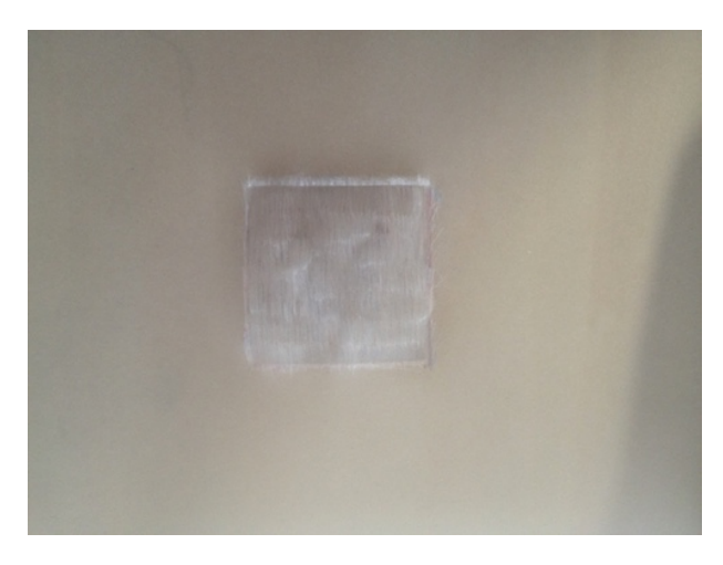
Fig.7-11 (title to be confirmed), 2014, tracing paper, oil pen, blank ink pen / 21 x 27 cm