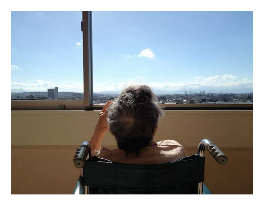
Figure 2: The photograph taken in the hospital, Tokyo, August 2012

The photograph bellow was taken when I was experiencing such 'spatiality' of the 'untranslatable' [Fig.2]. I was looking at a distant scene from the hospital window with my grandmother, and she, who was on the threshold of dementia, misunderstood a mountain in the scenery for another mountain. However, the way she described what she saw felt so beautiful and convincing that there felt something untranslatable yet emotionally true in what I was seeing in the distance through her eyes. In this situation, she was an artist and I became an observer of her view.