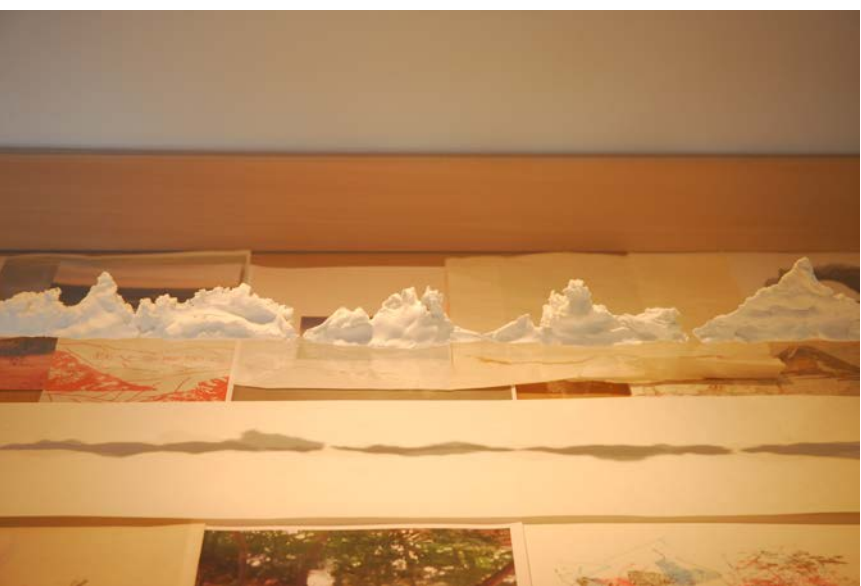
Fig.3-4 Understanding of misunderstanding, 2013, collage with mixed media, paper clay,