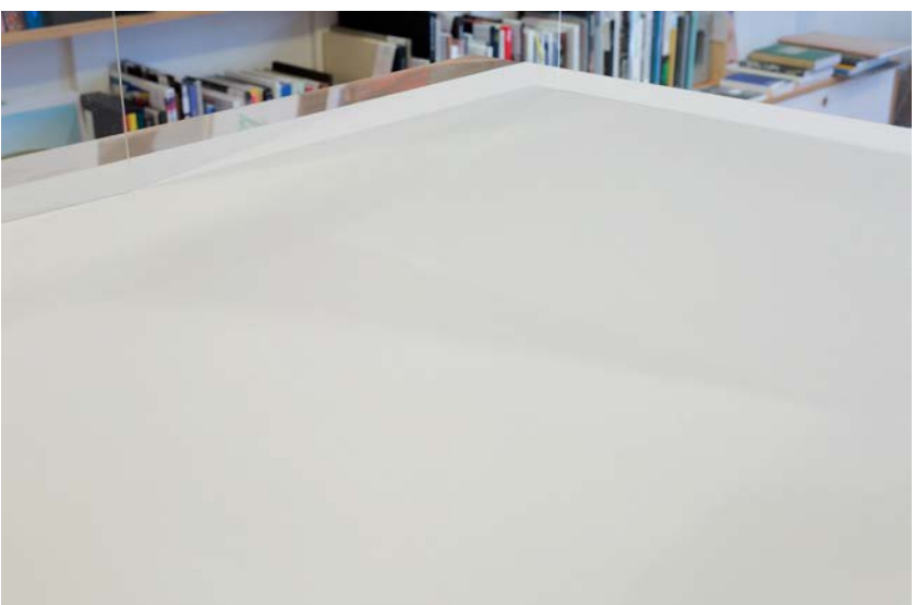
Fig.5-6 Distancing for Opening , 2014, Oak, Acrylic sheet, Inkjet print on etching paper / 60.5x73x154(H)cm